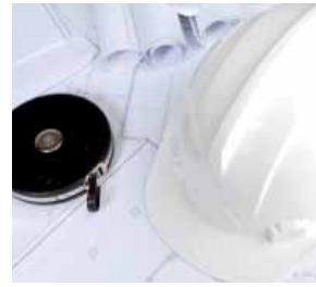
Servicing, inspection & installation

masking curtains and systems • wall curtains • acoustic fabrics • screen surfaces screen frames • projection ports • seating • stair nosing • screen cleaning • servicing